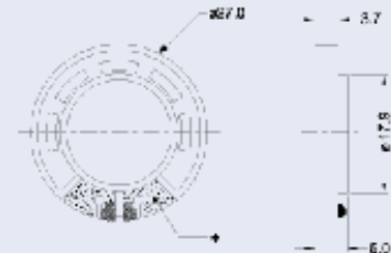
HOUSING MATERIAL : ABS