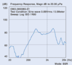
Frequency Response Curve (Distance: 0.5m) 頻率響應圖